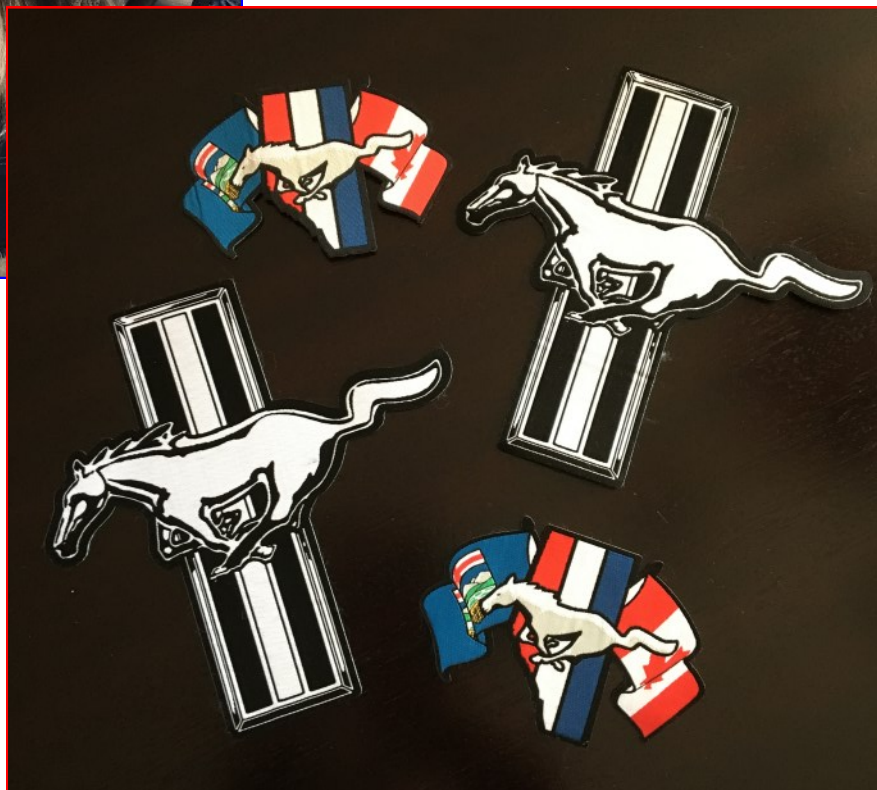
Large B&W white—15 cm high, small coloured 10 x 6.5 cm.