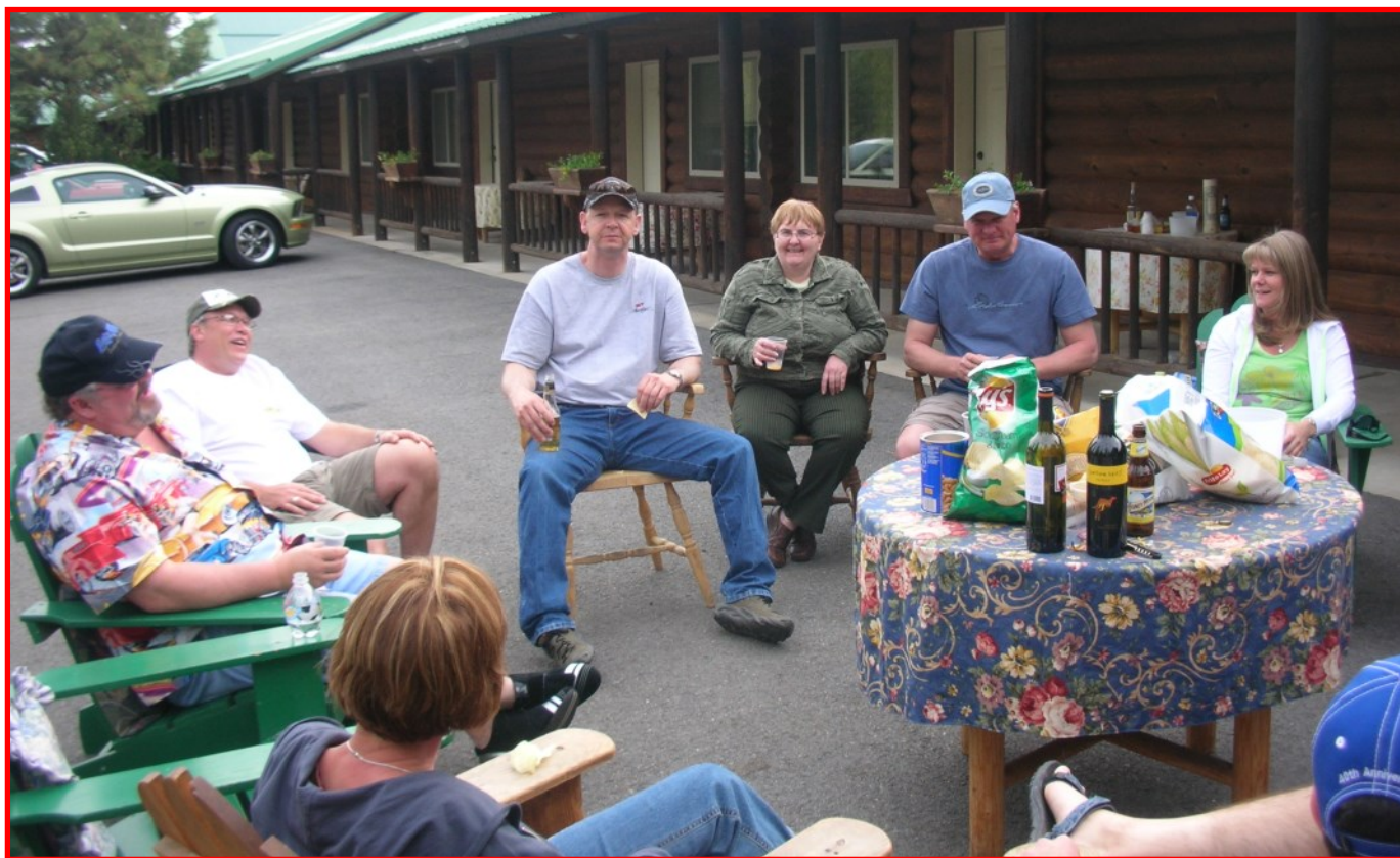
May 2009 Run to the Sun - Sandpoint Idaho