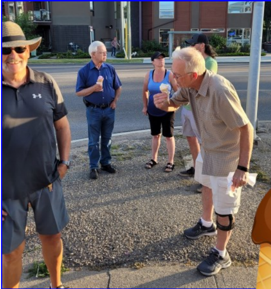
Our regular meeting night in July found the club cruising to Lics for Ice Cream on a hot day!