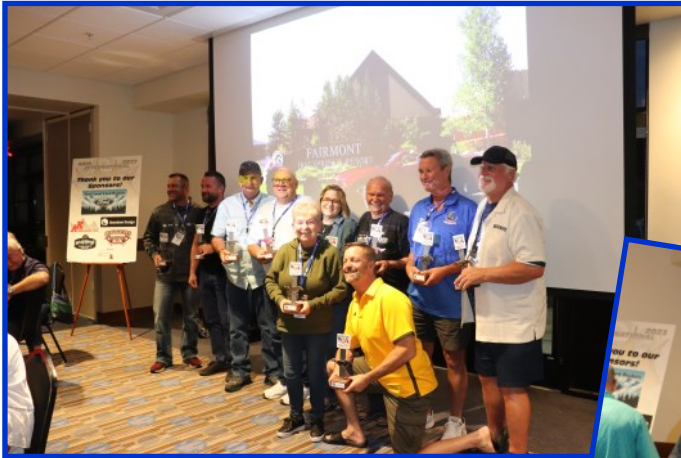
A few of our members brought home awards! Congrats!