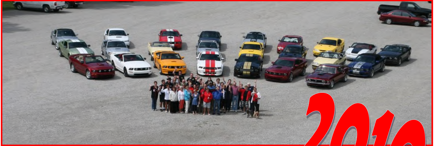
Poker Run—Cochrane, AB