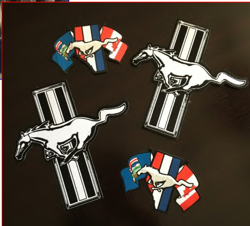
Large B&W white—15 cm high, small coloured 10 x 6.5 cm.